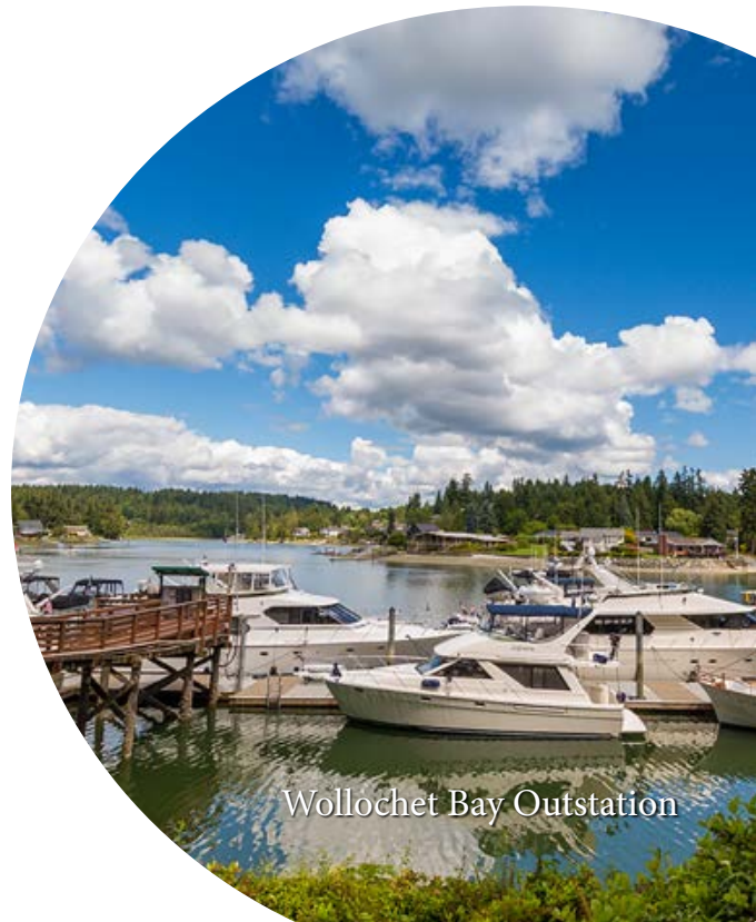
Wollochet Bay Outstation

The club maintains many outstations for the enjoyment of Active Members. Wollochet Bay in Gig Harbor and Oro Bay on Anderson Island are great weekend getaways. To the south is Swan Town Marina in Olympia. Farther north are Cornet Bay in Deception Pass, and Deer Harbor on Orcas Island. We also have outstations at Dock Street Marina in downtown Tacoma, and the TYC guest dock. TYC also offers a Select Marina Program which reimburses members for stays at other marinas in the Puget Sound area.