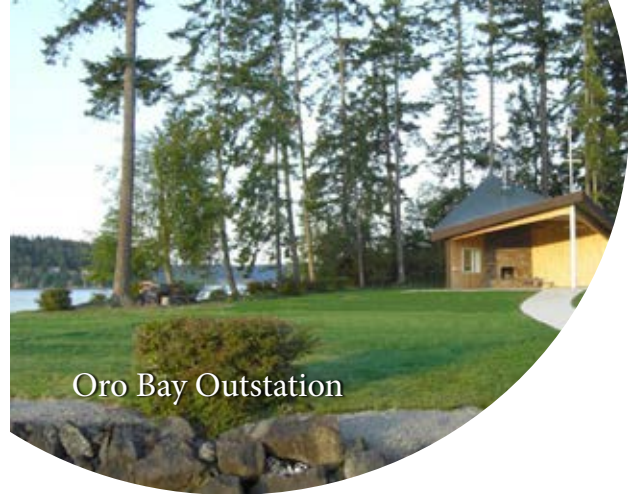
Oro Bay Outstation

The members of Tacoma Yacht Club are proud of our heritage and excited about our future.